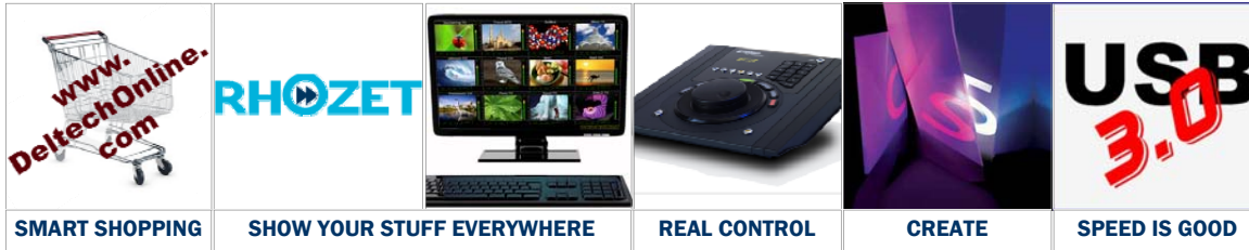
SMART SHOPPING SHOW YOUR STUFF EVERYWHERE REAL CONTROL CREATE SPEED IS GOOD