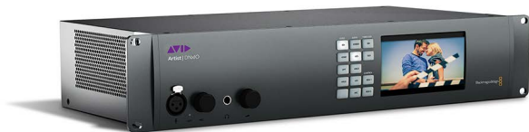
Capture, monitor, and accelerate SD, HD, UHD, 2K, and 4K editing with an Artist | DNxIO interface.

For the latest Media Composer requirements, qualified systems, and configuration guidelines, please visit www.avid.com/MCreqs .